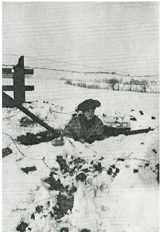
Het onderkomen van de Essex Scottish in het winters landschap rond Groesbeek.

This regiment set up camp in Groesbeek (near Nijmegen) and stayed here until 8 February 1945 when Operation Veritable started. During this time the regiment went on several patrols to Mook, Boxtel, Vught.