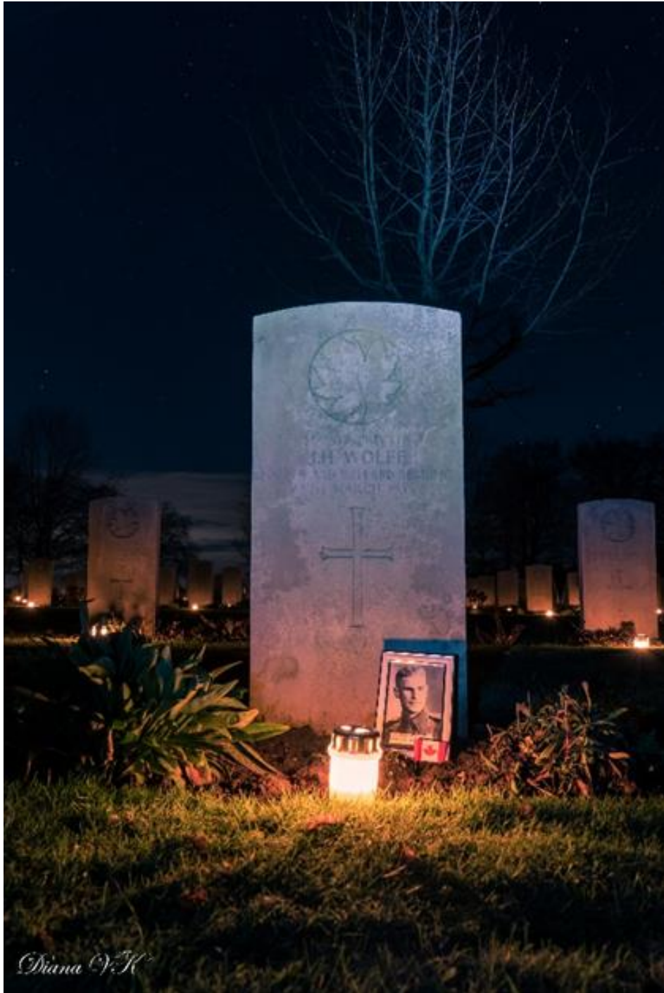
Christmas Eve 24 December 2018.